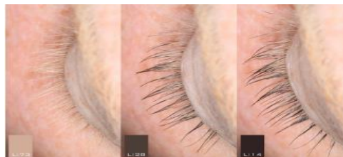
Baseline Carbon Black Dispersion Ink Black Chip AQ

Clinical test shows that a mascara formula with Distinctive ® Ink Black Chip AQ showed higher color intensity than a formula with a standard carbon black aqueous dispersion.